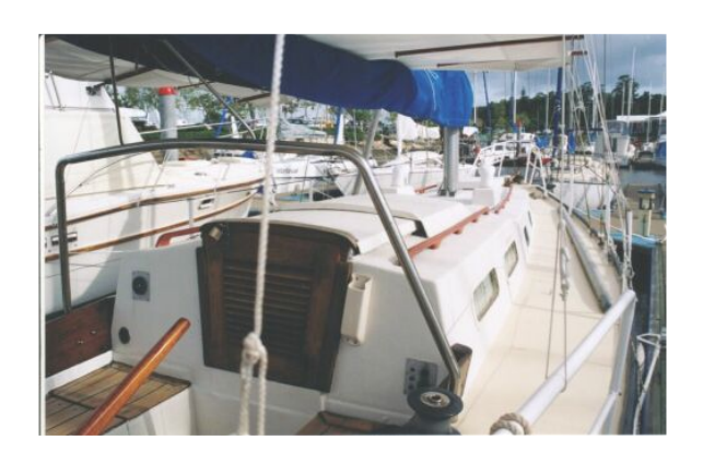
Note the companionway on centerline.