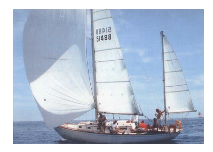
Snow Goose #42

I always welcome more pictures of the boats for our archives. If you have a favorite, consider passing it along. Of particular interest are photos of unique features or improvements that you have made. These pictures are always of special interest at Seabreeze gatherings. Send me traditional pictures or email me digital images.